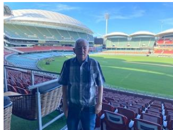
View from hotel dining room / bar