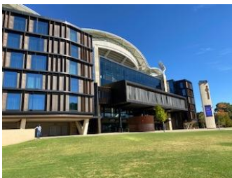
Home for five nights The Oval Hotel