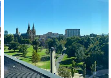
View to North Adelaide from hotel