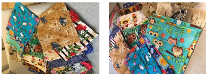
'Pockets of Hope' provided by our Sew & So ladies group to the St John of God Hospital in Geelong.